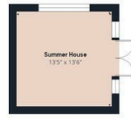
Floor 0 Building 4